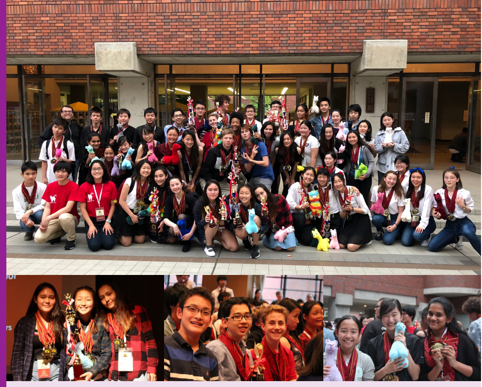
The Senri and Osaka International Schools students show off their medals and trophies after the Kansai Round of the World Scholar's Cup, hosted by Doshisha International School on May 5-6. SOIS took top honors in both the Junior and Senior Divisions. Congratulations to the scholars! More information can be found on page 8.